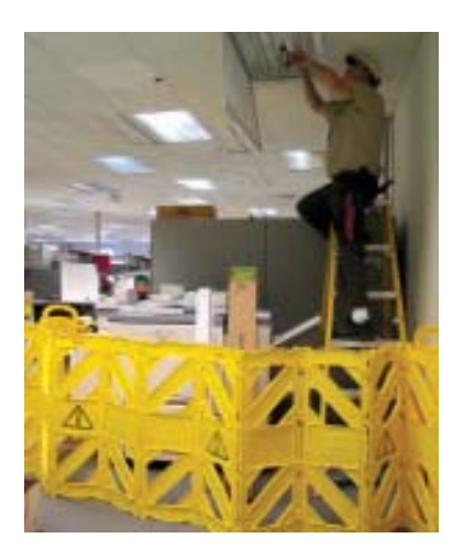
For indoor use. Flexible—can be set straight, curved or in a circle.