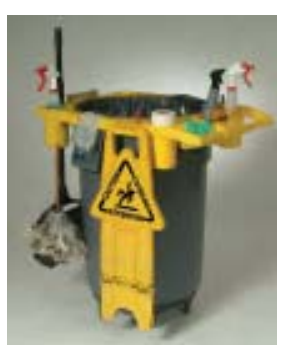
Designed for convenient storage or transport on Janitor Cart (#6173) or Rim Caddy (#9W87)

Unique "no-tip" design and bold graphics quickly capture pedestrian's attention.